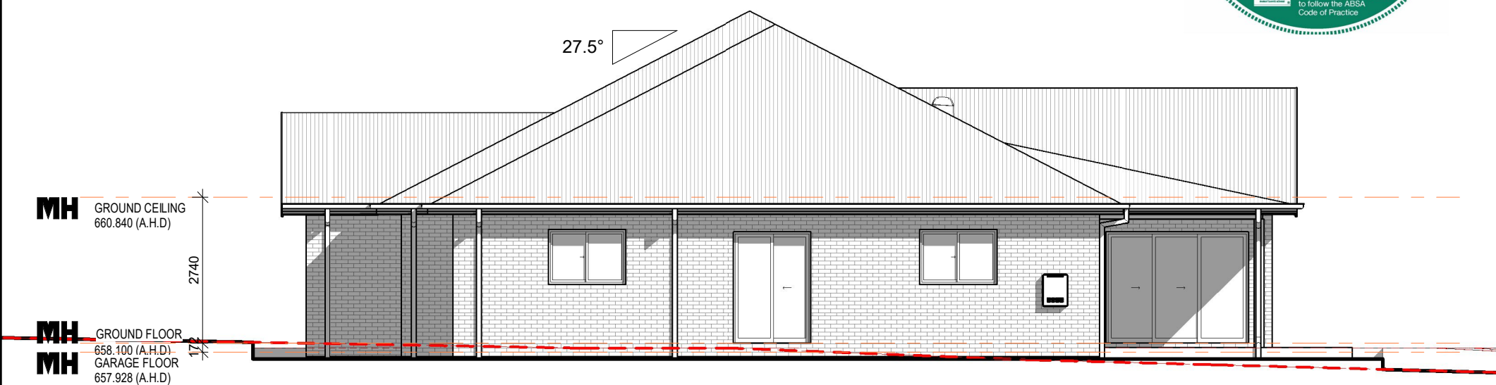
3 NORTH-EAST ELEVATION 1 : 100

BASIX COMMITMENTS REFER TO Basix Certificate & Pg.08 No.1183594S