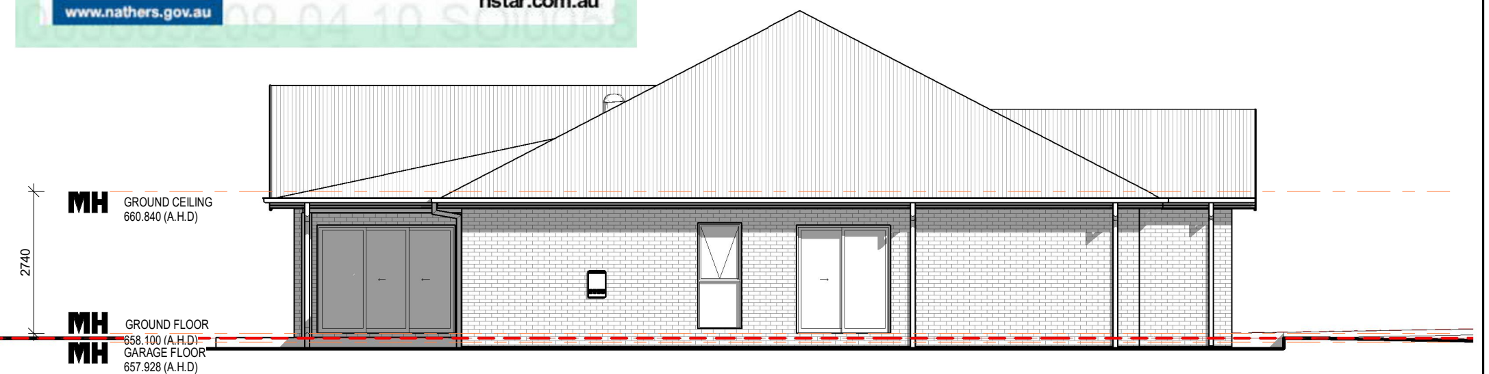
4 SOUTH-WEST ELEVATION 1 : 100